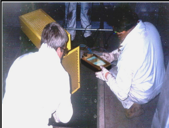
Left - Fans being balanced which are in operation on a furnace.