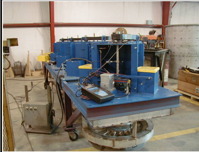
Left - A fan balancing work cell in our factory.