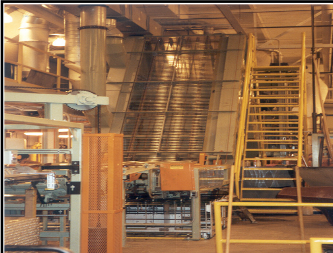
Left - High speed fluorescent tube conveyor.