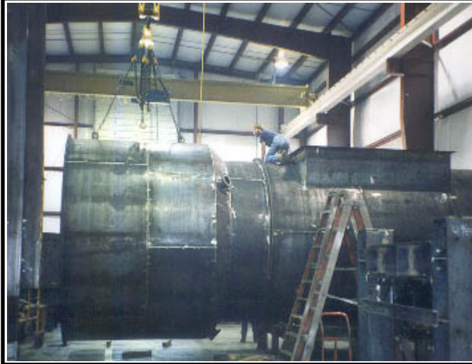
Left - 16' diameter duct for steel plant.